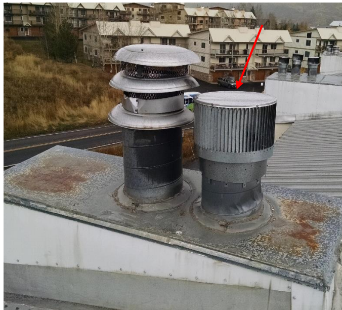
Manufactured Chimney System

This report has been produced in accordance with our agreement and is subject to the terms and conditions agreed upon therein. All printed comments and the opinions expressed herein are those of the Inspection Company.