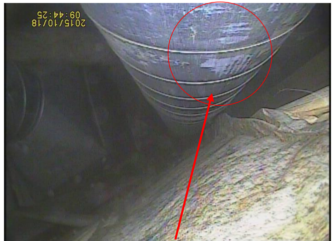
Signs of moisture damage on the outer wall of the chimney

This report has been produced in accordance with our agreement and is subject to the terms and conditions agreed upon therein. All printed comments and the opinions expressed herein are those of the Inspection Company.