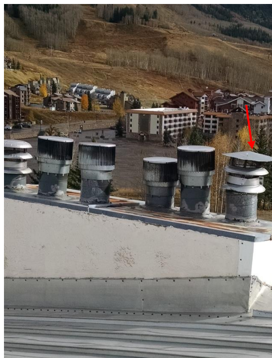
Manufactured Chimney System

This report has been produced in accordance with our agreement and is subject to the terms and conditions agreed upon therein. All printed comments and the opinions expressed herein are those of the Inspection Company.