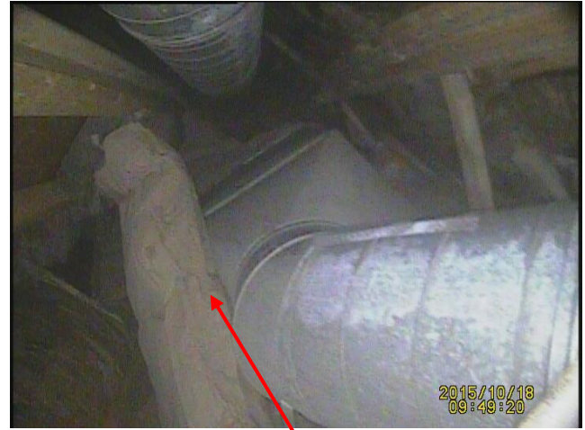
Insulation has fallen on top of a fireplace. This is a serious fire hazard

This report has been produced in accordance with our agreement and is subject to the terms and conditions agreed upon therein. All printed comments and the opinions expressed herein are those of the Inspection Company.