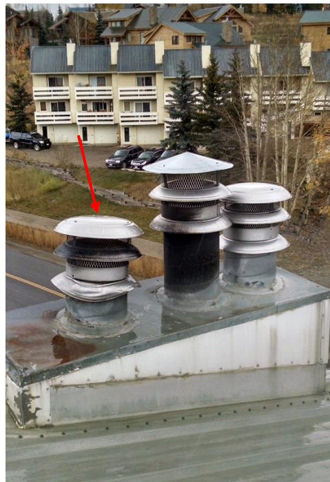
Manufactured Chimney System

This report has been produced in accordance with our agreement and is subject to the terms and conditions agreed upon therein. All printed comments and the opinions expressed herein are those of the Inspection Company.