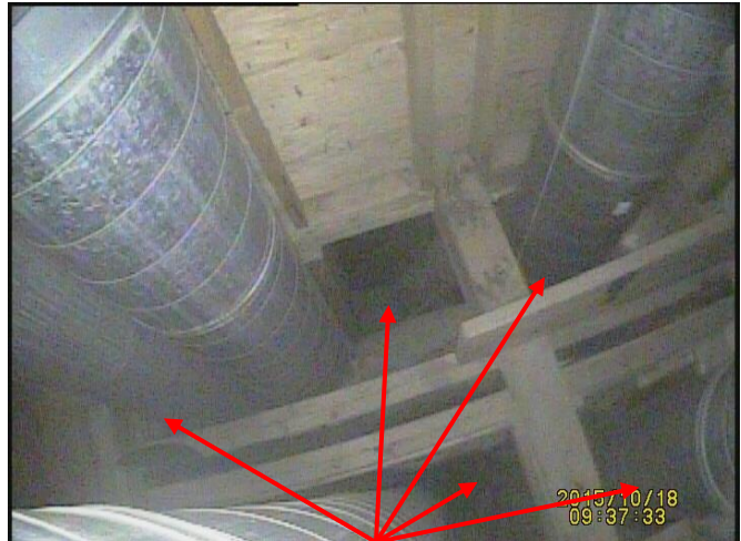
Each chimney must have a firestop where it passes through a floor/ceiling. No firestops have been provided