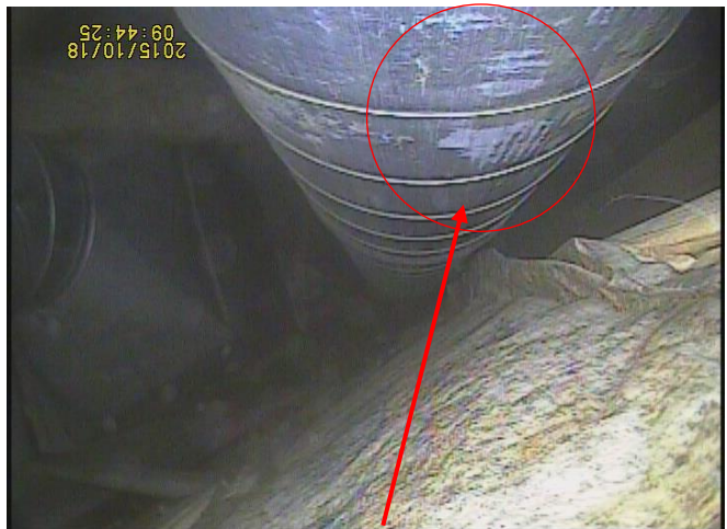
Signs of moisture damage on the outer wall of the chimney

This report has been produced in accordance with our agreement and is subject to the terms and conditions agreed upon therein. All printed comments and the opinions expressed herein are those of the Inspection Company.