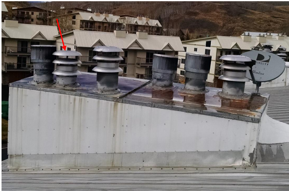
Manufactured Chimney System

This report has been produced in accordance with our agreement and is subject to the terms and conditions agreed upon therein. All printed comments and the opinions expressed herein are those of the Inspection Company.