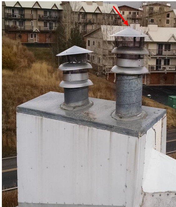
Manufactured Chimney System

This report has been produced in accordance with our agreement and is subject to the terms and conditions agreed upon therein. All printed comments and the opinions expressed herein are those of the Inspection Company.