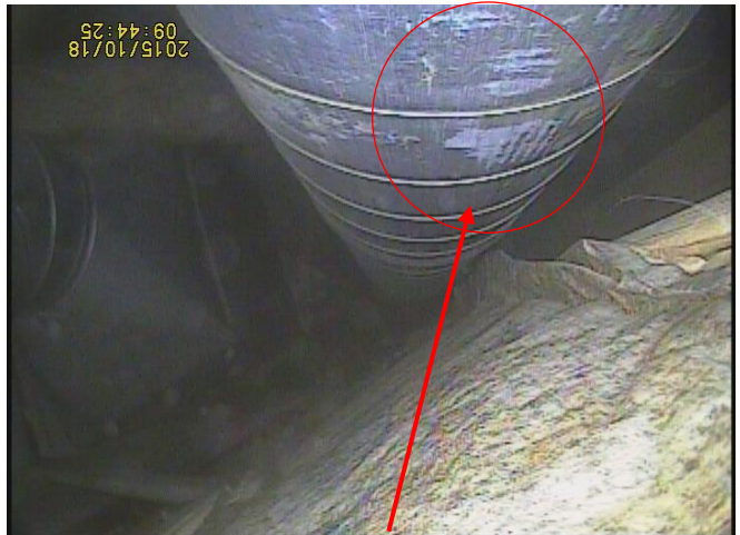
Signs of moisture damage on the outer wall of the chimney

This report has been produced in accordance with our agreement and is subject to the terms and conditions agreed upon therein. All printed comments and the opinions expressed herein are those of the Inspection Company.