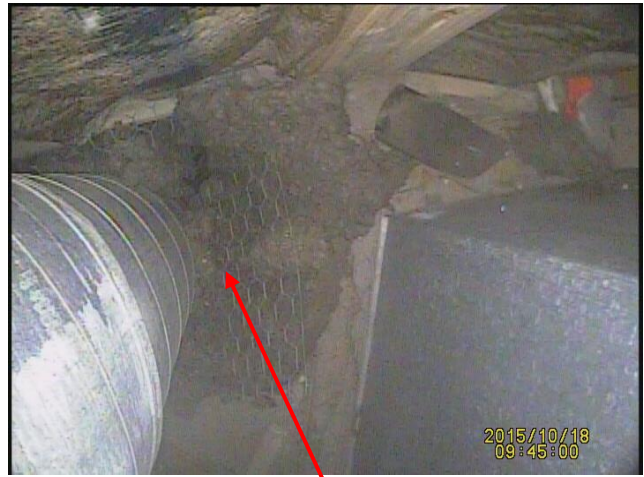
It appears that insulation has been placed on chicken wire in place of an adequate firestop. This is not approved and is a fire hazard

This report has been produced in accordance with our agreement and is subject to the terms and conditions agreed upon therein. All printed comments and the opinions expressed herein are those of the Inspection Company.