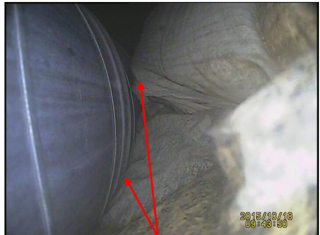
Combustible insulation in direct contact with the chimney. This is a serious fire hazard