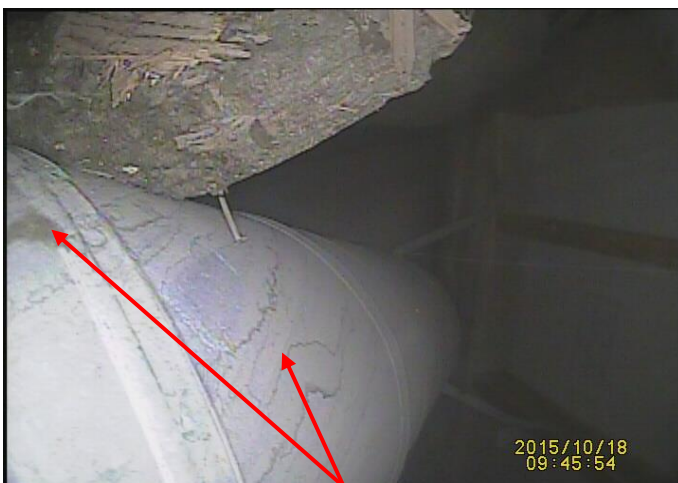
Signs of moisture presents on the outer wall of the chimney