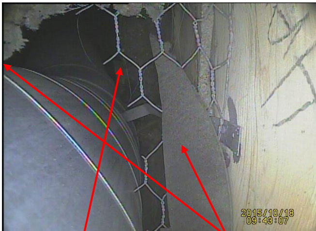
No firestop provided where chimney passes through floor/ceiling Debris touching chimney, a 2" airspace must be maintained