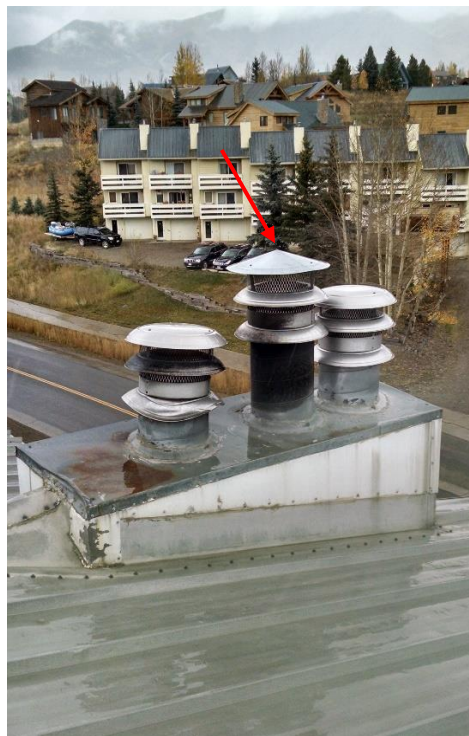
Manufactured Chimney System