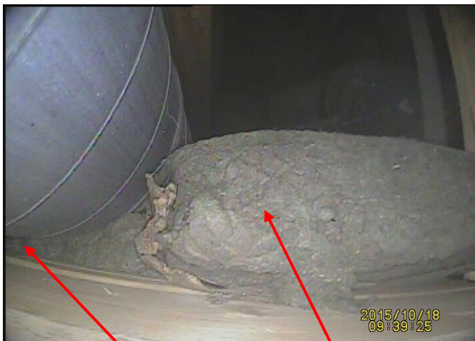
Inadequate clearance to combustible building materials and insulation, which are in direct contact with the chimney. This is a serious fire hazard