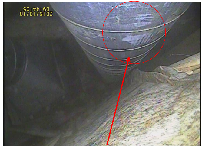
Signs of moisture damage on the outer wall of the chimney

This report has been produced in accordance with our agreement and is subject to the terms and conditions agreed upon therein. All printed comments and the opinions expressed herein are those of the Inspection Company.