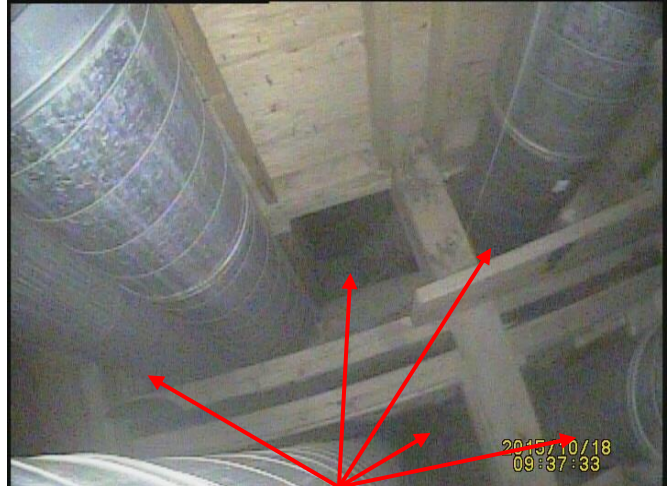
Each chimney must have a firestop where it passes through a floor/ceiling. No firestops have been provided