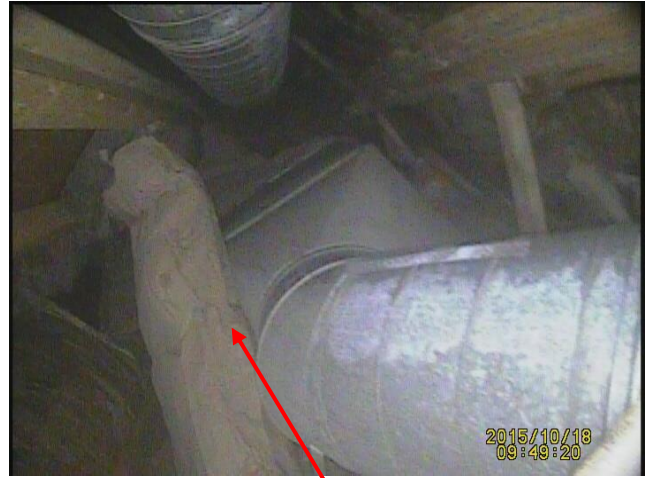
Insulation has fallen on top of a fireplace. This is a serious fire hazard

This report has been produced in accordance with our agreement and is subject to the terms and conditions agreed upon therein. All printed comments and the opinions expressed herein are those of the Inspection Company.