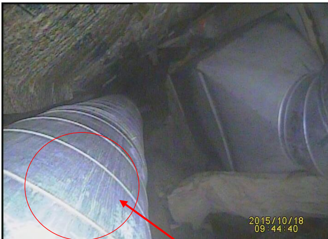
Lines of moisture running in and out of the seams of the outer wall of the chimney

A.14.3 (Chimney inspection required to ensure)....(32) Freedom from rust or corrosion of readily accessible metal parts in factory-built fireplaces and chimneys