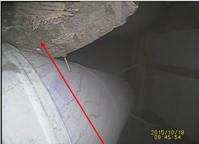
Combustible building material in direct contact with the chimney. This is a serious fire hazard

6.1.1 Factory-built chimneys and chimney units shall be listed and installed in accordance with..... the listing and the manufacturer's instructions.