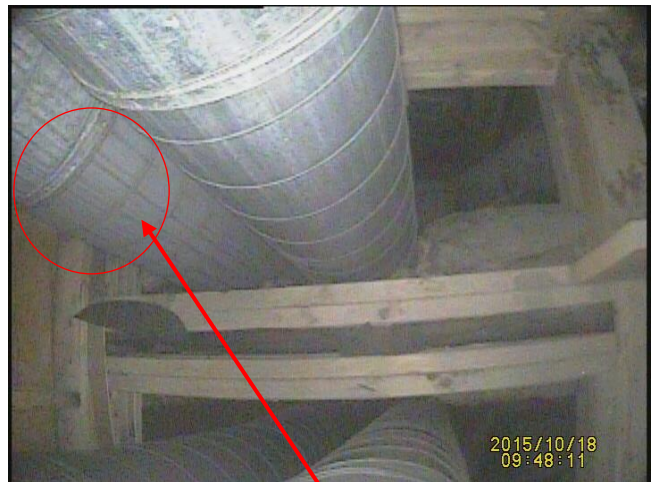
Lines of moisture running in and out of the seams of the outer wall of the chimney