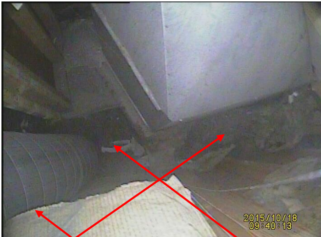
Insulation touching chimney & fireplace, a 2" airspace is required No firestop provided where chimney passes through floor/ceiling

7.1.6.2 All spaces between chimneys and the floors and ceilings through which the chimneys pass shall remain fully open but shall be firestopped with noncombustible material.