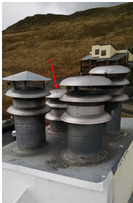
Manufactured Chimney System

This report has been produced in accordance with our agreement and is subject to the terms and conditions agreed upon therein. All printed comments and the opinions expressed herein are those of the Inspection Company.