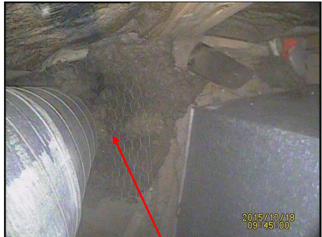
It appears that insulation has been placed on chicken wire in place of an adequate firestop. This is not approved and is a fire hazard

This report has been produced in accordance with our agreement and is subject to the terms and conditions agreed upon therein. All printed comments and the opinions expressed herein are those of the Inspection Company.