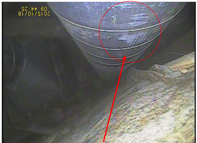
Signs of moisture damage on the outer wall of the chimney

This report has been produced in accordance with our agreement and is subject to the terms and conditions agreed upon therein. All printed comments and the opinions expressed herein are those of the Inspection Company.