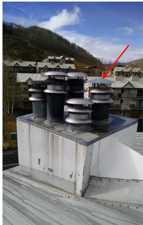
Manufactured Chimney System

This report has been produced in accordance with our agreement and is subject to the terms and conditions agreed upon therein. All printed comments and the opinions expressed herein are those of the Inspection Company.