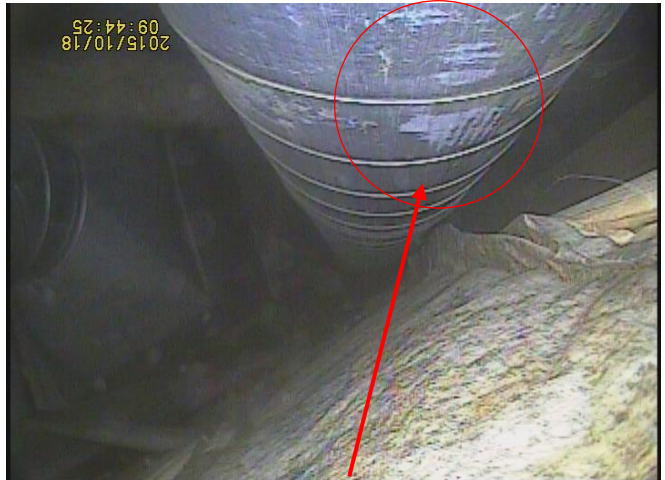
Signs of moisture damage on the outer wall of the chimney

This report has been produced in accordance with our agreement and is subject to the terms and conditions agreed upon therein. All printed comments and the opinions expressed herein are those of the Inspection Company.