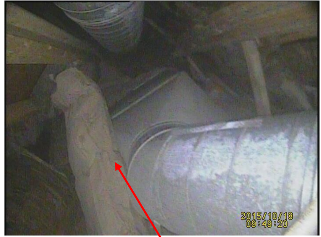
Insulation has fallen on top of a fireplace. This is a serious fire hazard

This report has been produced in accordance with our agreement and is subject to the terms and conditions agreed upon therein. All printed comments and the opinions expressed herein are those of the Inspection Company.